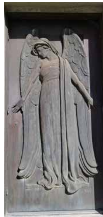
Angel of Death, head down and solemn, guarding the door to the tomb