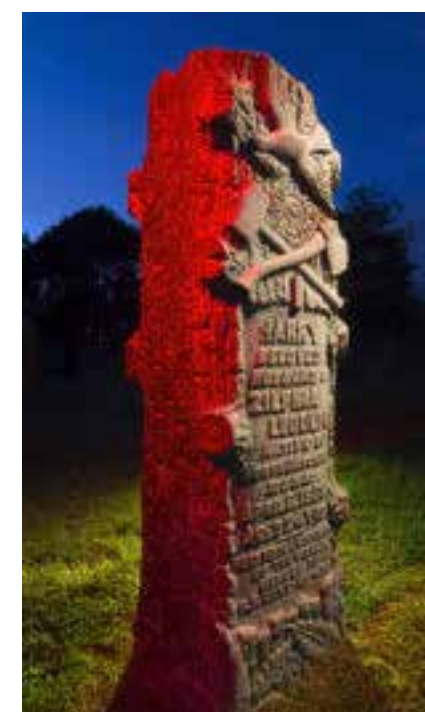
The two pictures above were taken by night photographer Troy Paiva.