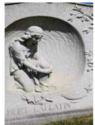
Angel watching the lamp of life burn