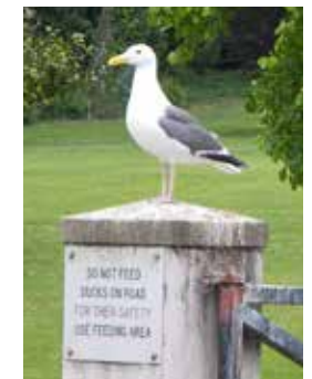
Cypress Lawn Habitat