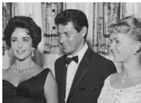
Eddie Fisher with his most famous wives