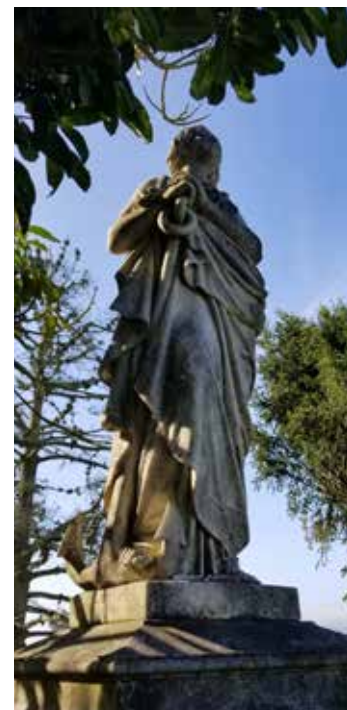
Eyes to heaven, holding anchor. Christians adopted the anchor as a symbol of hope in future existence because it was regarded as a symbol of safety in ancient times.

Every human being is faced with stressful events. The most stressful is the death of a spouse or loved one. The many decisions to be made and items to be paid can be overwhelming. Since 1892, the licensed trained associates at Cypress Lawn have guided our community through difficult times ensuring they are able to celebrate life, heal from their loss, and really have time to remember those they love. Families selecting Cypress Lawn and its affiliates report the value exceeded the cost, the staff was incredibly caring and they are happy they trusted us. When you have one chance to tell your loved one’s story — choose Cypress Lawn.