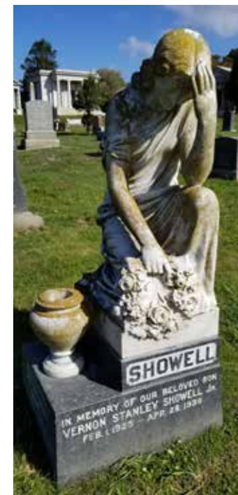
Grief over the loss a child