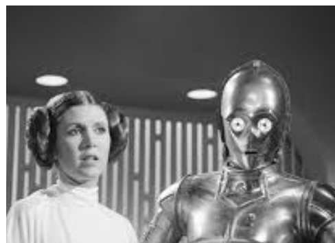
Daughter Carrie Fisher. Her mother is Debbie Reynolds.