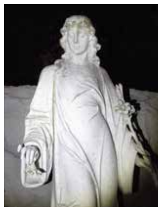
Angel dropping flower as symbol of the end of life.