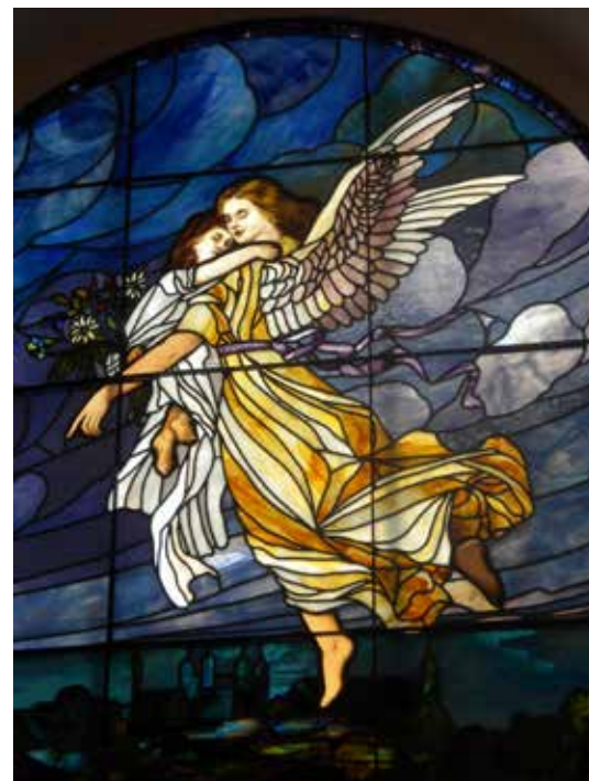
In this depiction, the angel is transporting a deceased child to heaven.